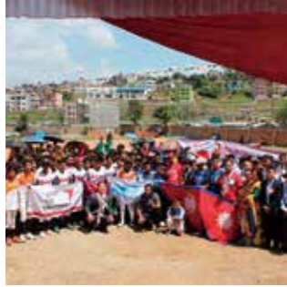
Constructing sport field in Nepal