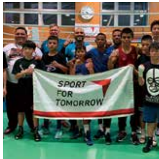
Field trip to Japan High Performance Sport Center