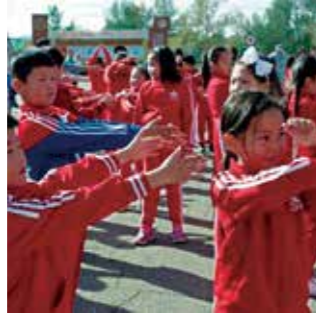
Exporting Japanese exercise program