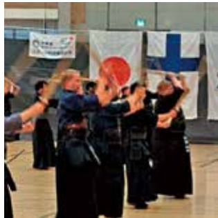
Interaction through Kendo in Finland