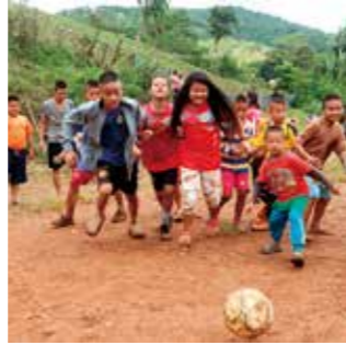
Sport event at Refugee Camps