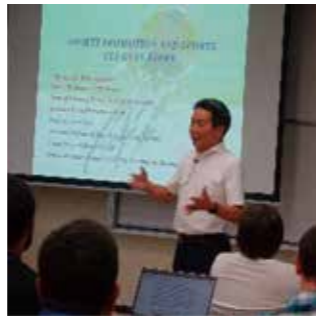
Implementation of international sports academy