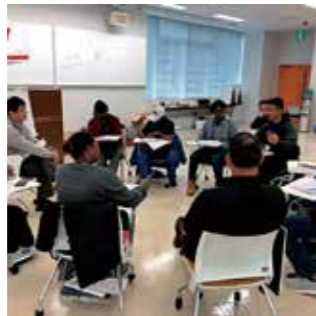
Support for the Asian countries to enhance participation for Paralympic Games