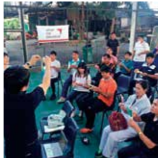
Teacher Training in Thailand