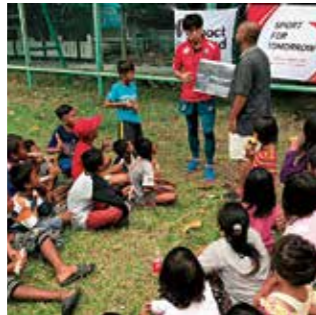
Interaction through Rugby at vulnerable areas disaster struck