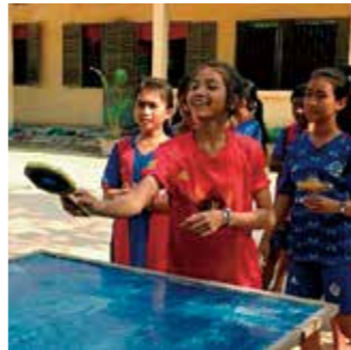
Support for the quality physical education in Cambodia