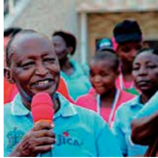
Support for women's sport in Tanzania