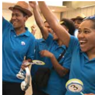
Promoting positive values in sport through education and activities